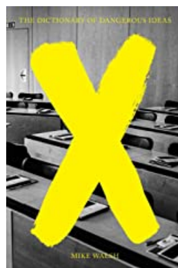
THE DICTIONARY OF DANGEROUS IDEAS