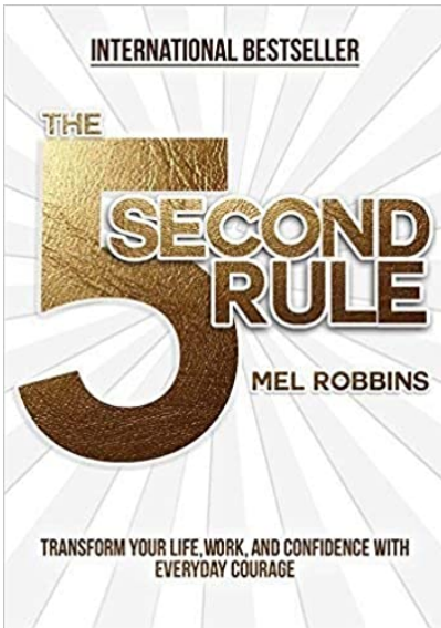
THE 5 SECOND RULE