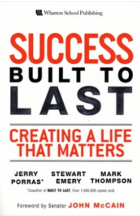
SUCCESS BUILT TO LAST