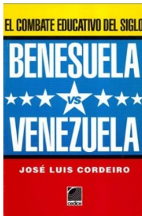
BENESUELA VS. VENEZUELA: EL COMBATE EDUCATIVO DEL SIGLO