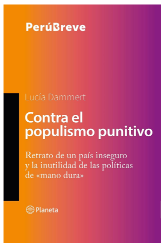
CONTRA EL POPULISMO PUNITIVO