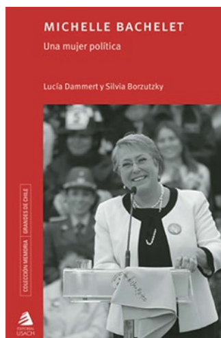
UNA MUJER POLITICA