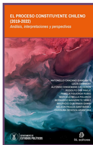
EL PROCESO CONSTITUYENTE CHILENO (2019-2022)