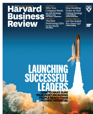
HARVARD BUSINESS REVIEW - LAUNCHING SUCCESSFUL LEADERS