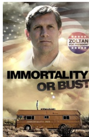
IMMORTALITY OR BUST