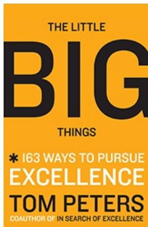
THE LITTLE BIG THINGS