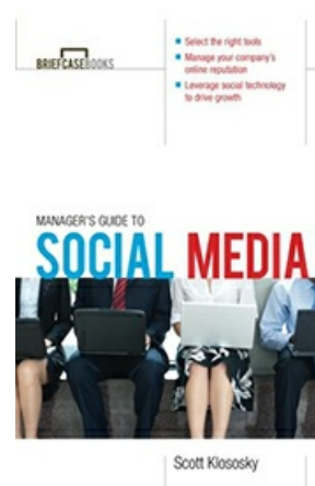
MANAGERS GUIDE TO SOCIAL MEDIA