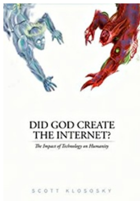
DID GOD CREATE THE INTERNET