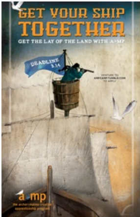
GET YOUR SHIP TOGETHER