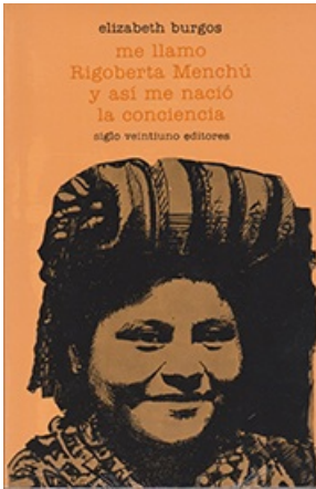
ME LLAMO RIGOBERTA MENCHÚ