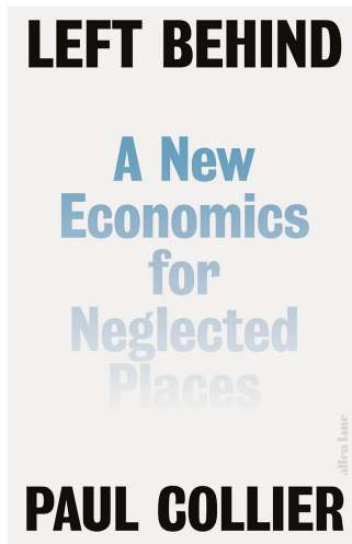
LEFT BEHIND UK