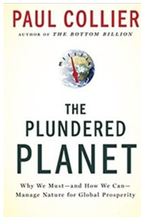
THE PLUNDERED PLANET