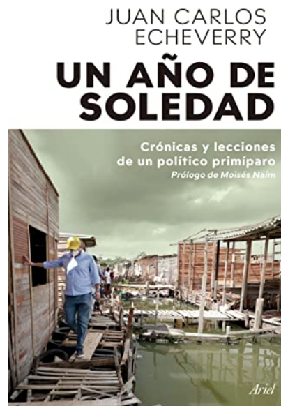
UN AÑO DE SOLEDAD