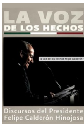
LA VOZ DE LOS HECHOS