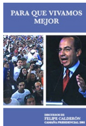
PARA QUE VIVAMOS MEJOR