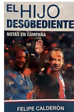
EL HIJO DESOBEDIENTE