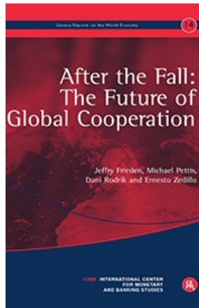
AFTER-THE-FALL-THE- FUTURE-OF-GLOBAL- COOPERATION