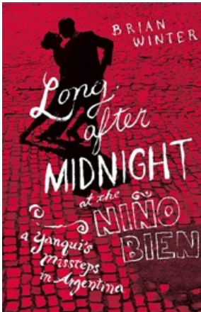
LONG AFTER MIDNIGHT AT THE NINO BIEN