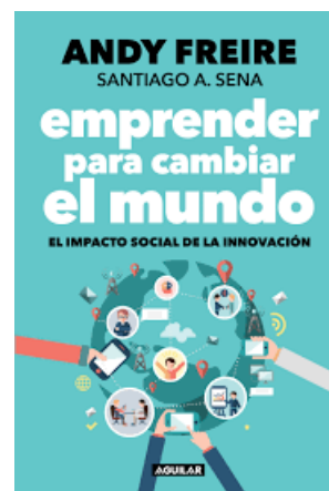
EMPRENDER PARA CAMBIAR EL MUNDO