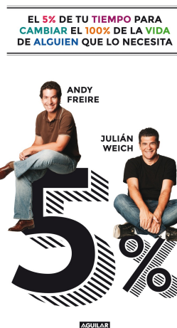
EL 5% DE TU TIEMPO PARA CAMBIAR EL 100% DE LA VIDA DE ALGUIEN QUE LO NECESITA