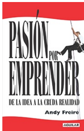
PASIÓN POR EMPRENDER