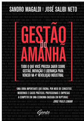
GESTÃO DO AMANHÃ