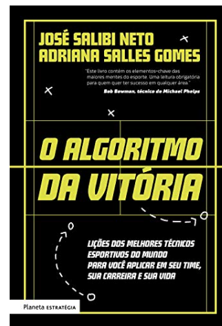
O ALGORITMO DA VITÓRIA