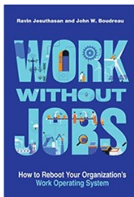
WORK WITHOUT JOBS