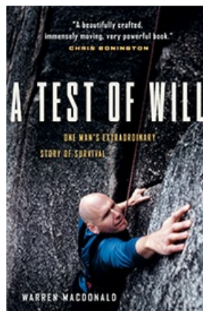
A TEST OF WILL