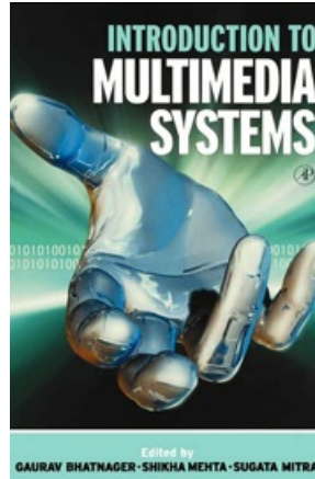
INTRODUCTION TO MULTIMEDIA SYTEMS