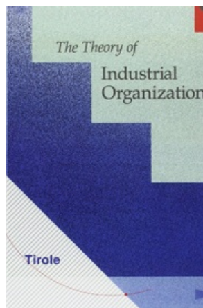
THE THEORY OF INDUSTRIAL ORGANIZATION