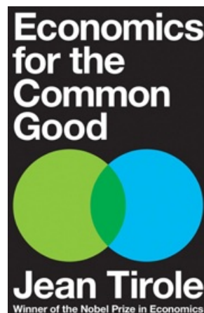
ECONOMICS FOR THE COMMON GOOD